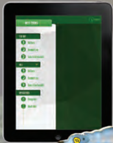
Paperless Checklist App