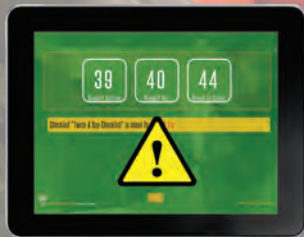
In Store Monitoring